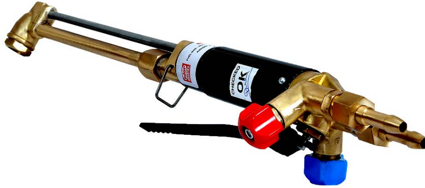
KING TORCH – IM (2 SEAT TYPE MANUAL GAS CUTTING TORCH)

THE 2 SEAT TYPE GAS CUTTING TORCH FROM ADOR